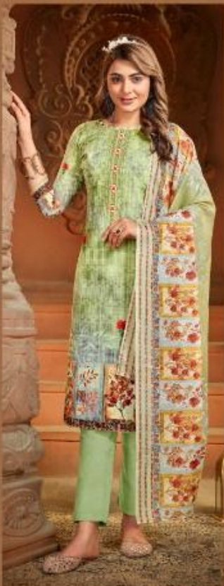
D. No. 1005