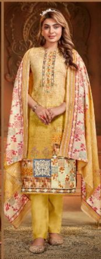
D. No. 1007