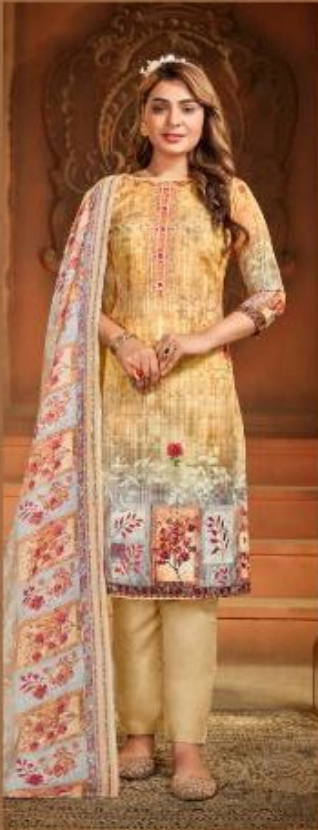
D. No. 1001