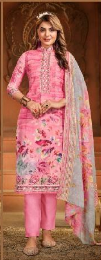
D. No. 1006