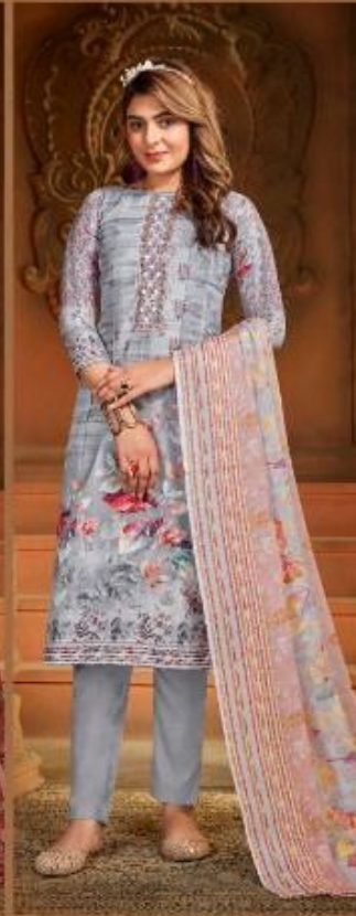
D. No. 1003