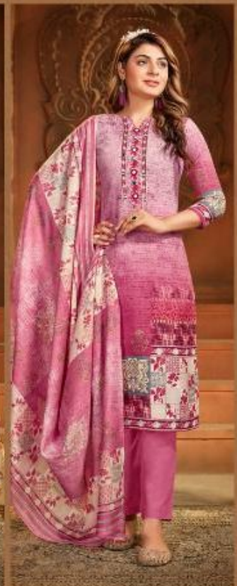
D. No. 1008