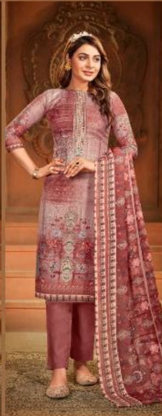
D. No. 1002