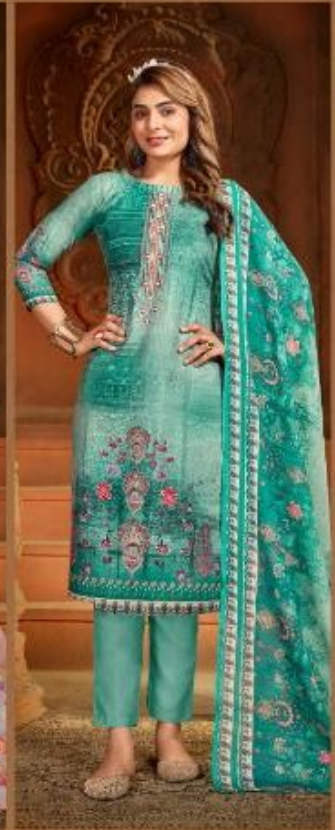
D. No. 1004