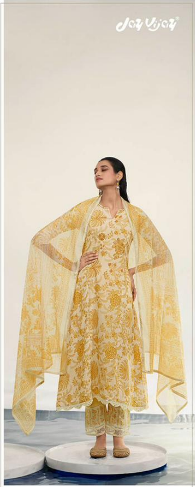
D.NO:8041 Like the refreshing perfume of summer flowers, this alluring print dress with hues of gold makes for our latest wardrobe must-have