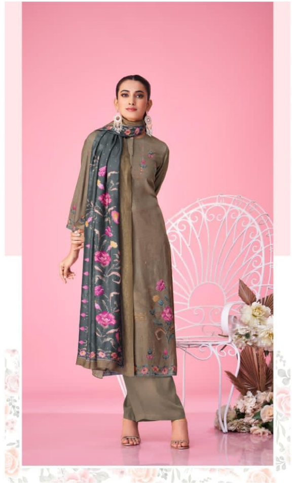
MERAK • 5335