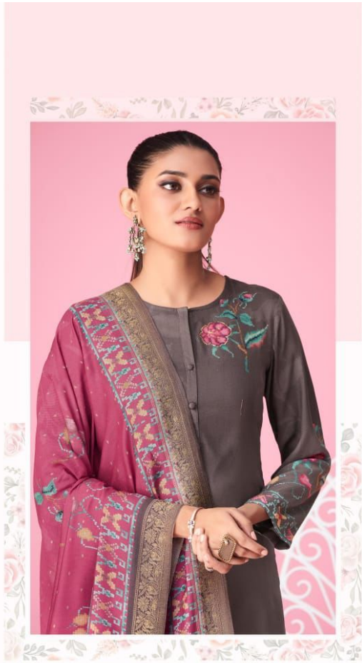
MERAK • 5393