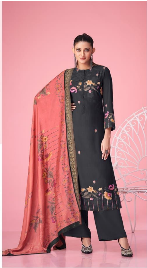
MERAK • 5389