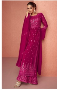
◆ 9395 ◆