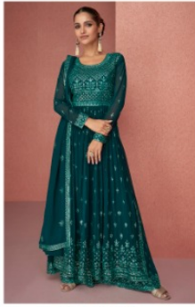
◆ 9394 ◆