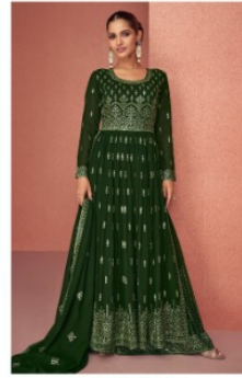
◆ 9398 ◆