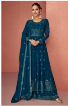
◆ 9396 ◆