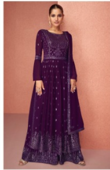
◆ 9397 ◆