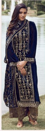
✧ 263 ✧