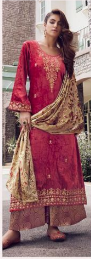
✧ 262 ✧