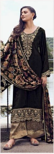
✧ 261 ✧