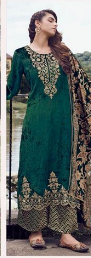
✧ 265 ✧