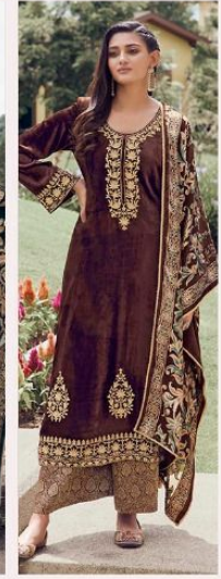
✧ 266 ✧