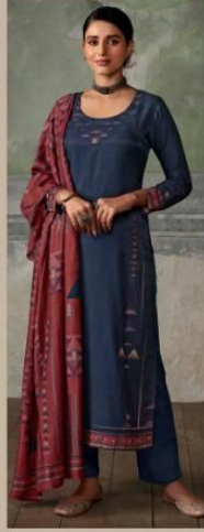
- 223 -