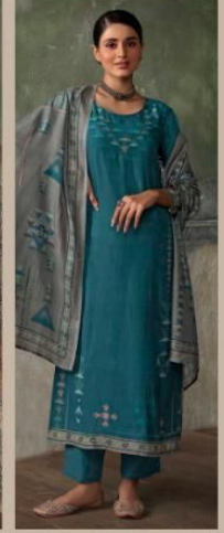
- 226 -