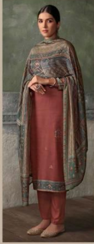
- 222 -