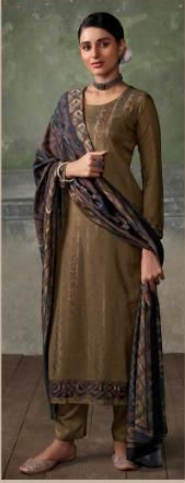
- 221 -