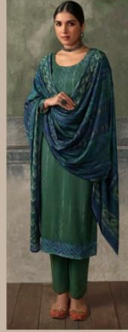
- 224 -