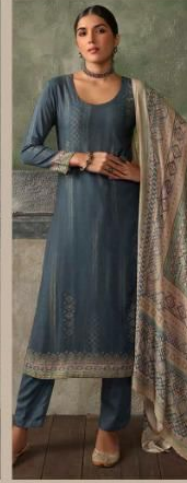
- 225 -