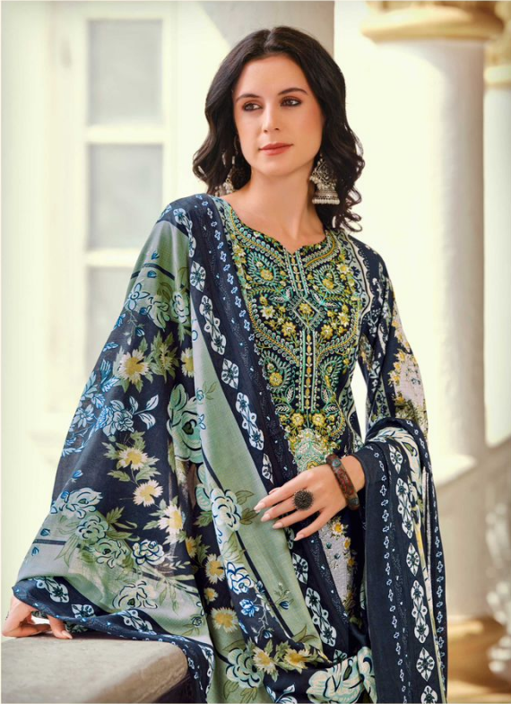
• ADORABLE DESIGNS • 1008-006