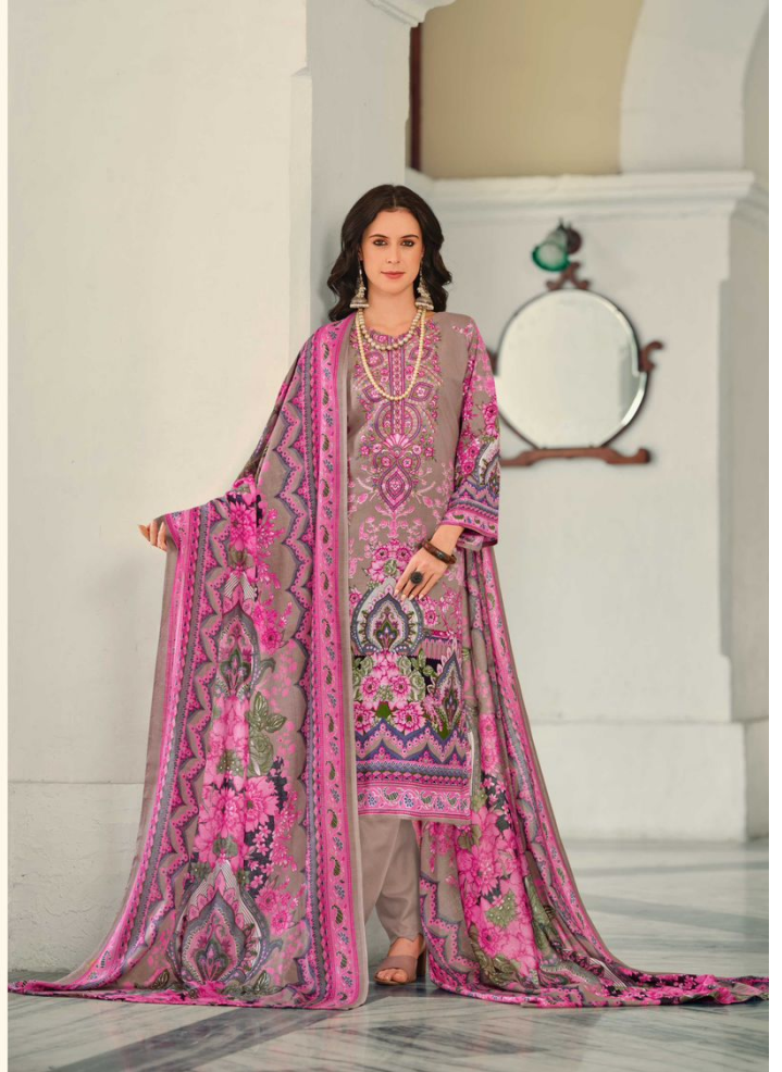
• EMBRACE ELEGANCE • 1008-007