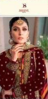
D-1065 B TOP: Georgette with embroidery BOTTOM: Satin DUPATTA: Net with embroidery