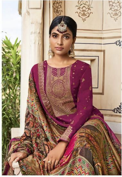
Pure heavenly designs gently crafted using the finest virgin fabrics to look perfect for you.