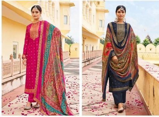
MANDAKINI | 6001