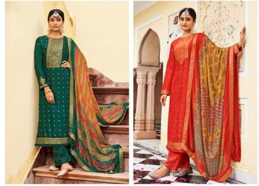
MANDAKINI | 6008