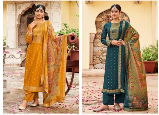
MANDAKINI | 6003