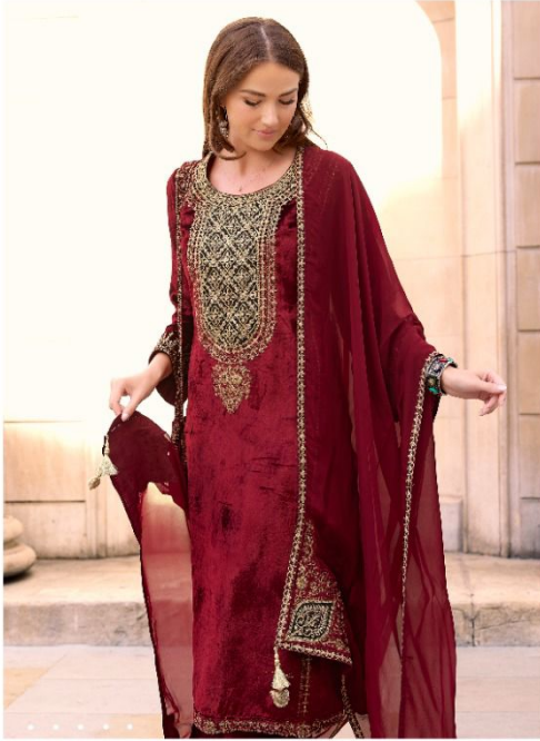
Weekday designs are created keeping in mind the sensibilities and culture of the nation by fashion designers and manufacturers of Indian garments. Kurti and Tunic, Indian fashion Kurti and Tunic are very much in fashion these days. Kurti (Tunic/Top) is just a women top. It is non-axillary top over jeans, skirts, Pant, Capri and even a suit. Indian Kurti/Tunic/Top are accepted worldwide. Kurti (Tunic/Top) look decent and discrete, versatile and stylish, trendy yet modest.