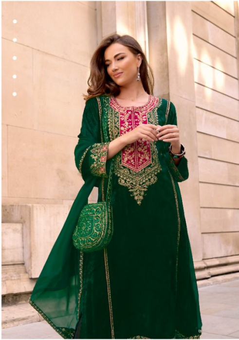
Indian fashion Salwar Kameez and Kurta are all the way comfortable yet elegant and easy to wear. Designer Kurta, Salwar Kameez and Charidar are the latest trend in Indian fashion, some are embellished with gorgeous embroidery work in pleasing designs. They manage to look smart enough to be worn for casual family gatherings, or even for a wedding ceremony.