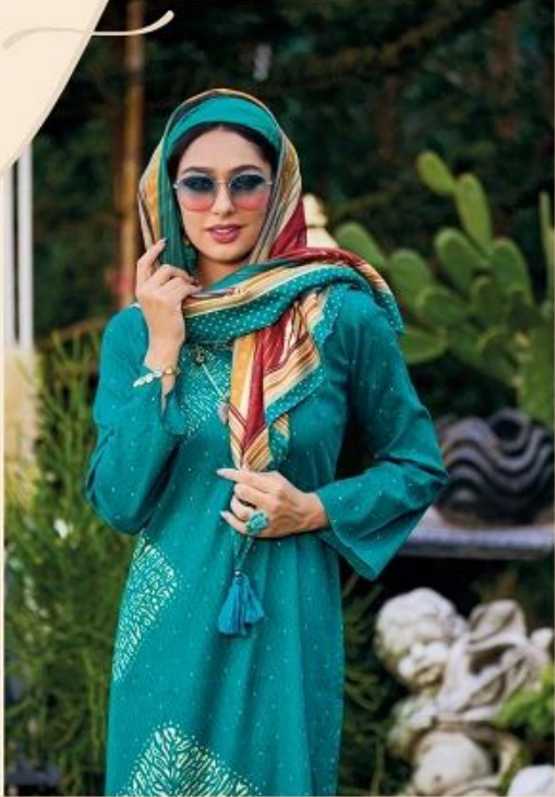
Fashion is a language that creates itself in clothes to interpret reality