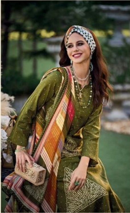
virtuous and Fair, Royal and gracious