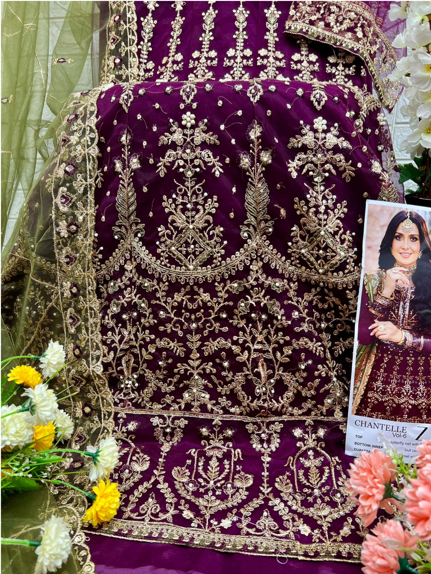
CHANTELLE Vol-6 Z TOP Butterfly net with BOTTOM-INNER Dull Sar DUPATTA net with