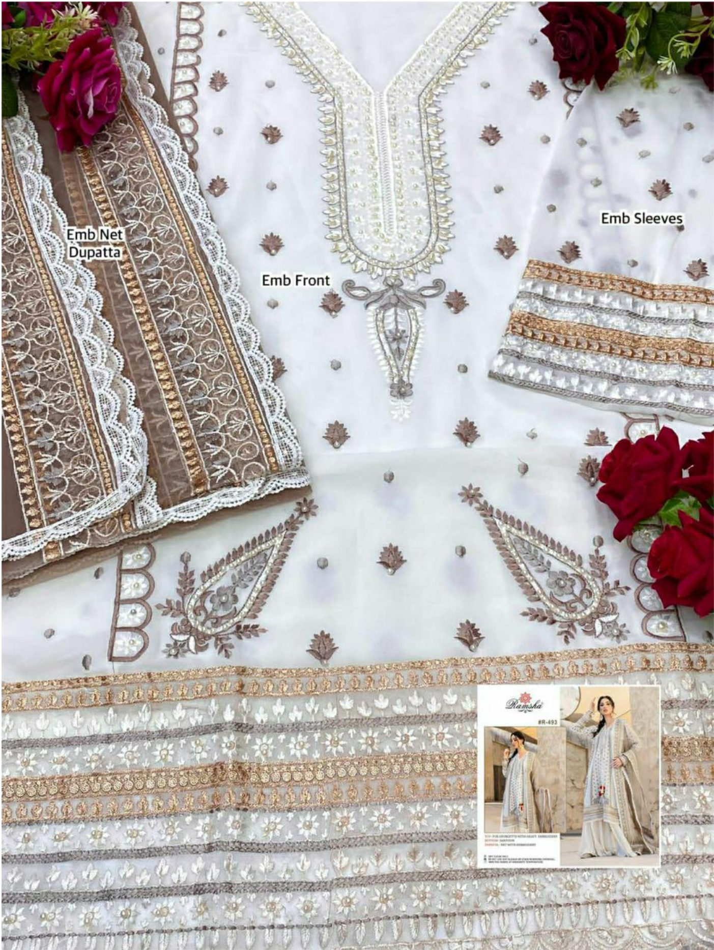
Emb Net Dupatta