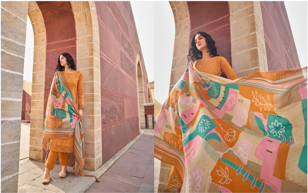
CLOTHES MEAN NOTHING UNTIL SOMEONE LIVES IN THEM