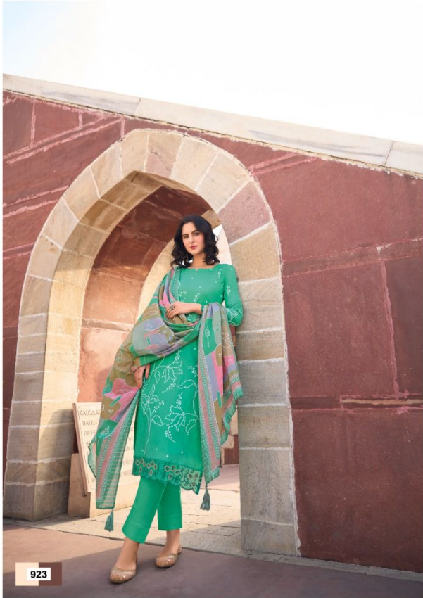
CLOTHES AREN'T GOING TO CHANGE THE WORLD. THE WOMEN WHO WEAR THEM WILL.