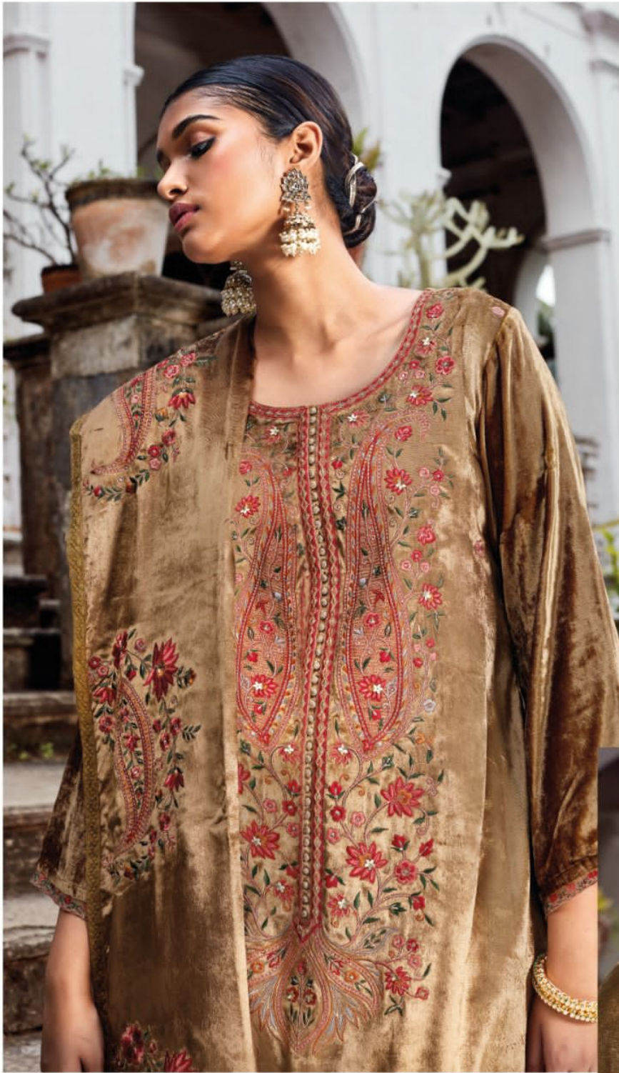
Ganga Fashions presents Mrunal Ethnic wear that can be donned on any auspicious festival, making your look graceful. Timeless designs, sewn with intricacy, celebrating the glory of celebrations.