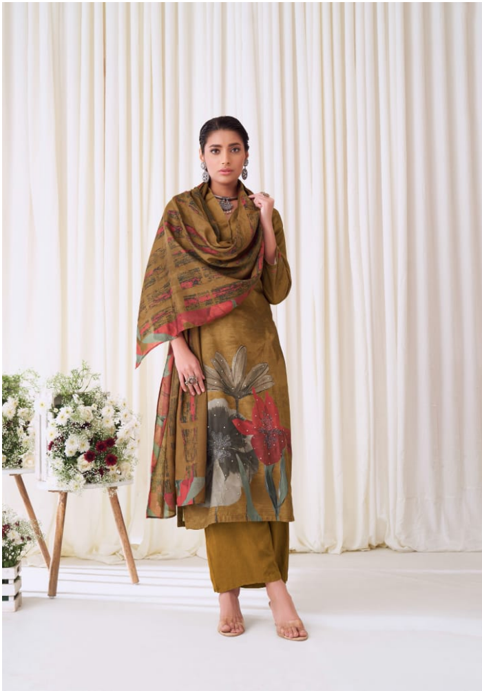
BLOTCHED | FLORAL 1734