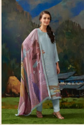
• 358 •