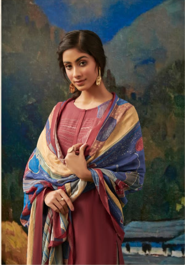
• 338 • Poorva