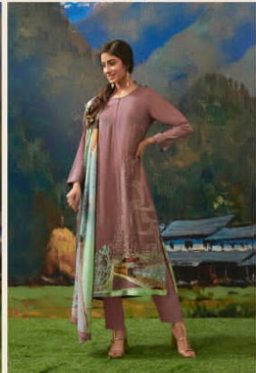
• 389 •