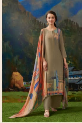
• 326 •