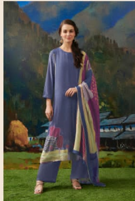
• 345 •