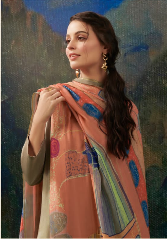
Poorva • 326 •