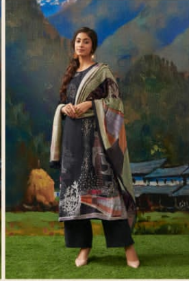
• 363 •