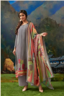
• 386 •