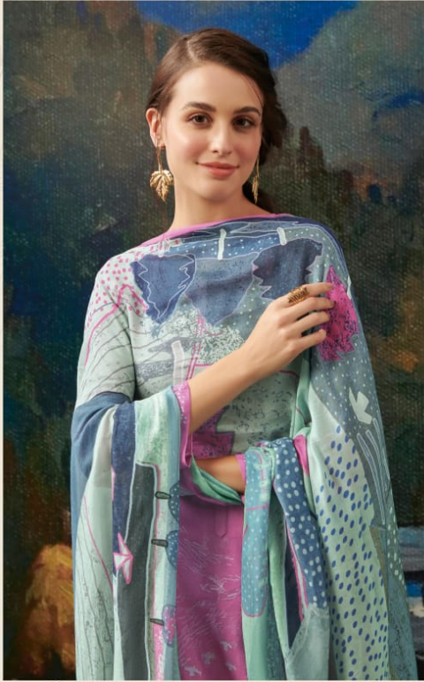
Poorva • 371 •