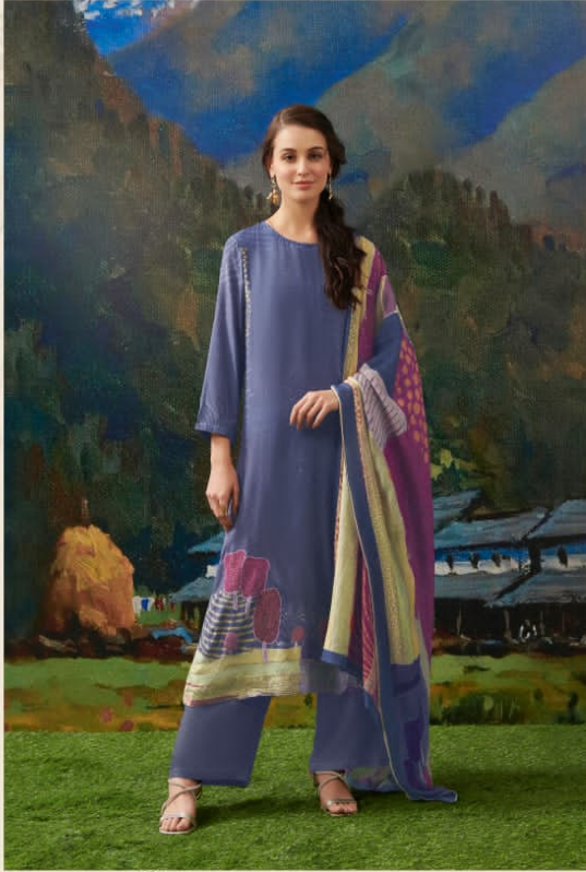
• 345 • Poorva