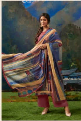
• 338 •