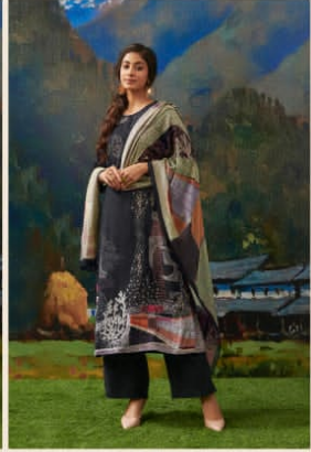
• 363 •