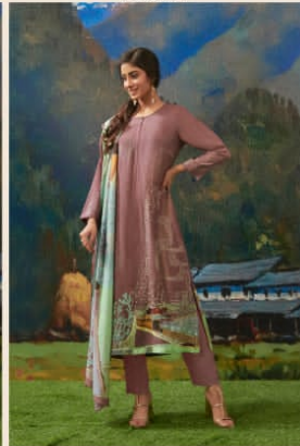
• 389 •