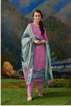
• 371 •