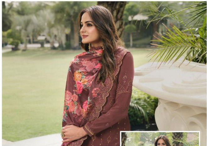
■ Hit refresh on your style with embroidered suit & print dupatta.