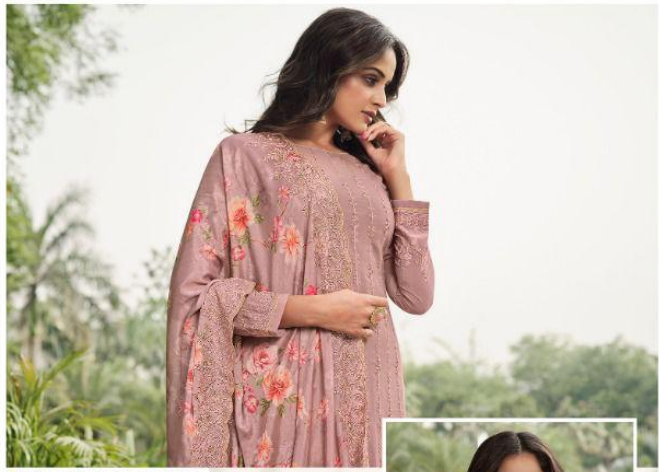
■ This season's blooming pieces for a radiant you!