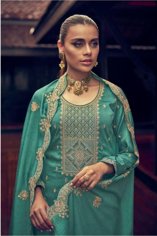
A | - 9656