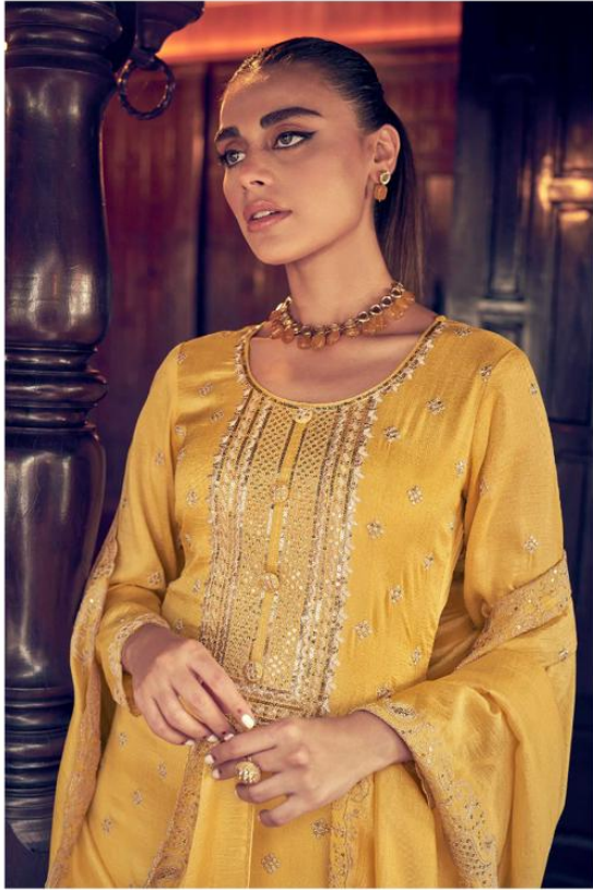
A - 9657