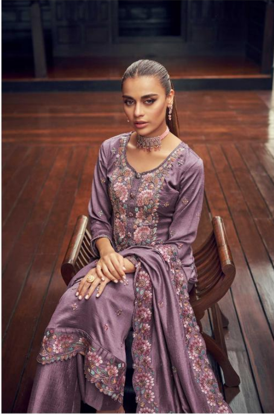
A - 9658