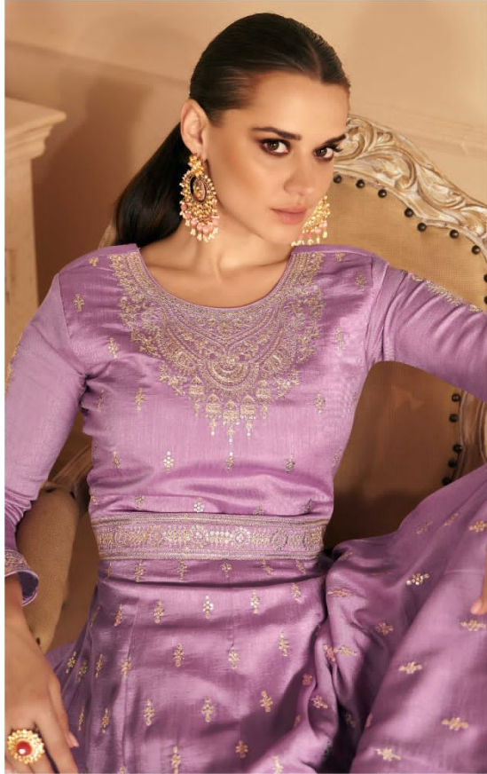
A - 9636