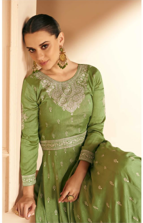
A | - 9640