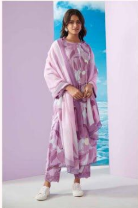
• 721 •