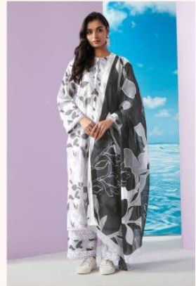
• 778 •