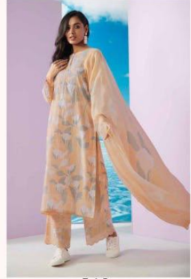
• 745 •