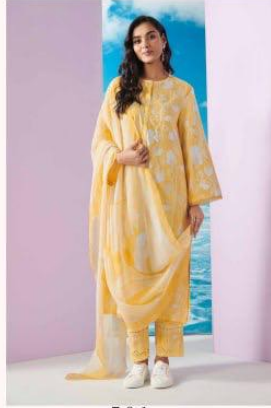
• 701 •