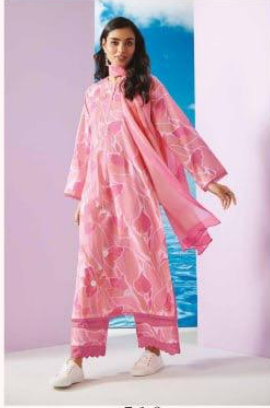
• 719 •