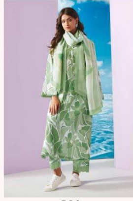
• 753 •