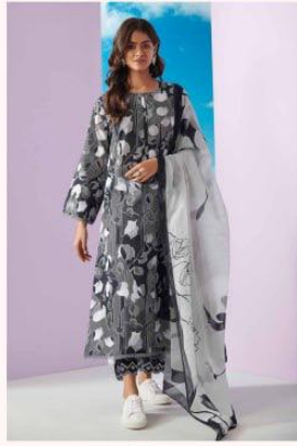
• 792 •