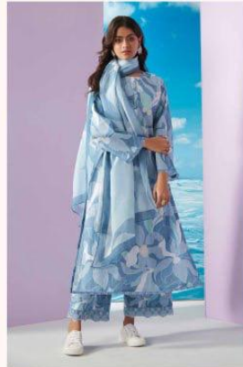
• 765 •