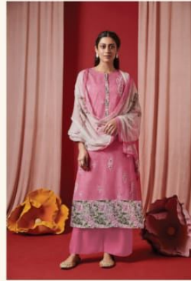
• 867 •