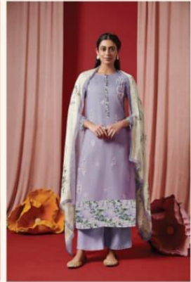
• 862 •