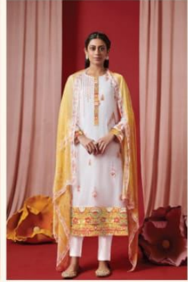
• 824 •