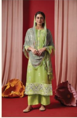
• 872 •