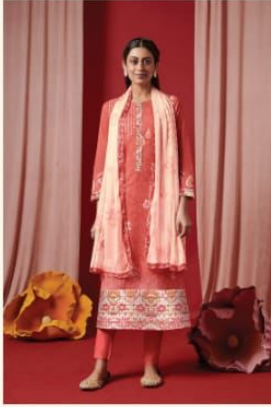
• 821 •