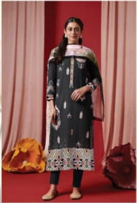
• 878 •