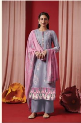
• 838 •