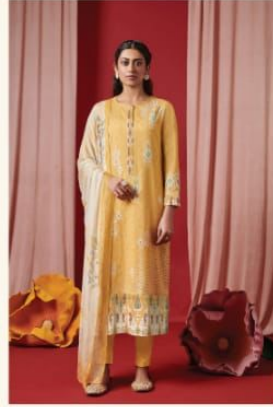
• 832 •