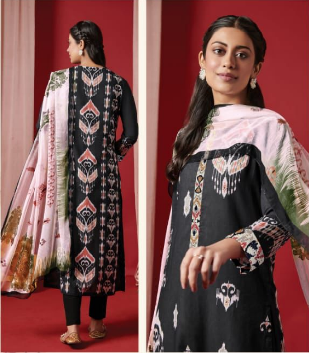
IKKAT • 878 •