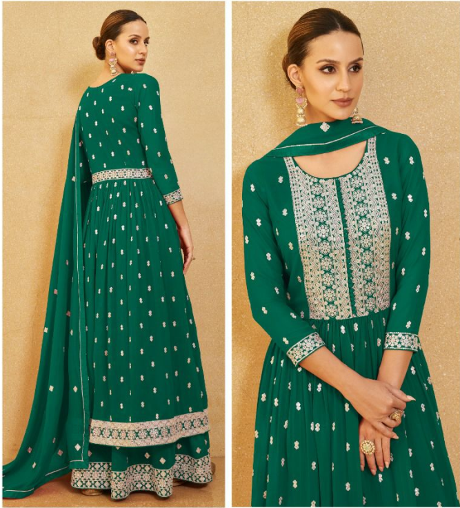
A - 9615