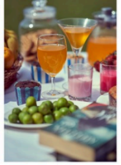
A scintillating plethora of timeless masterpiece inspired by beauty from Indian culture BAGEECHA | 8098