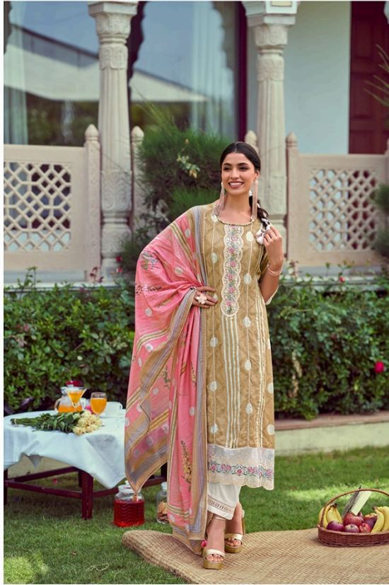
Different cultures come together in a tribute to fashion's biggest moment this season.