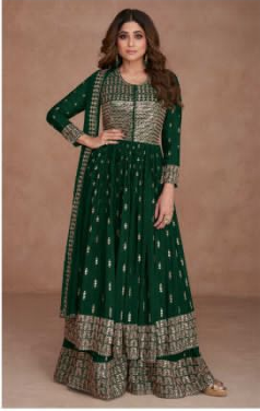
A | 9538