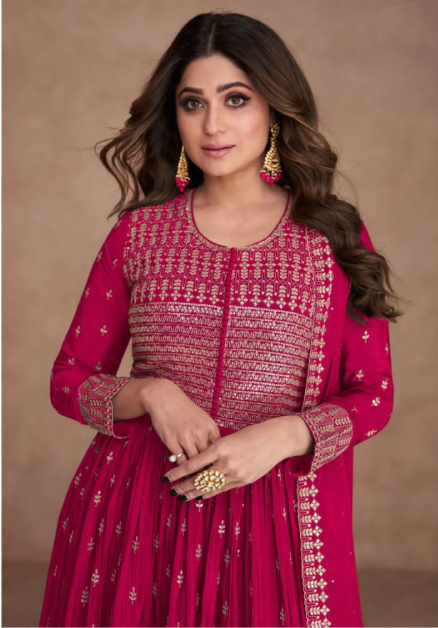
A | 9539