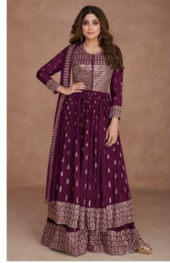
A | 9542