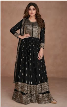
A | 9540