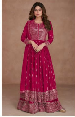
A | 9539