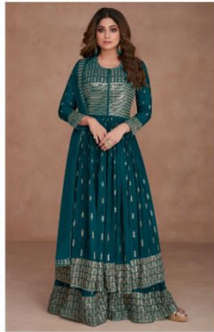
A | 9541