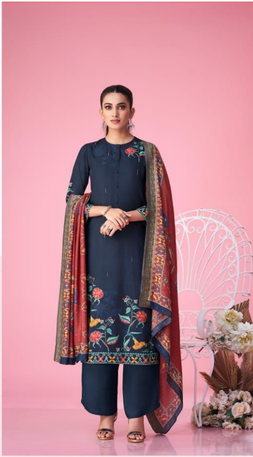
MERAK • 5343