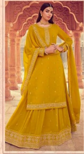
• 205 •