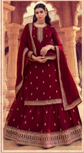
• 202 •