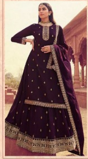
• 206 •