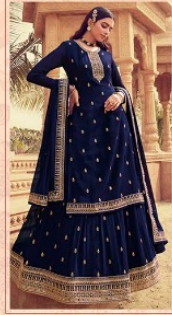
• 204 •