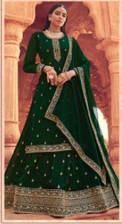
• 203 •