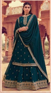
• 201 •