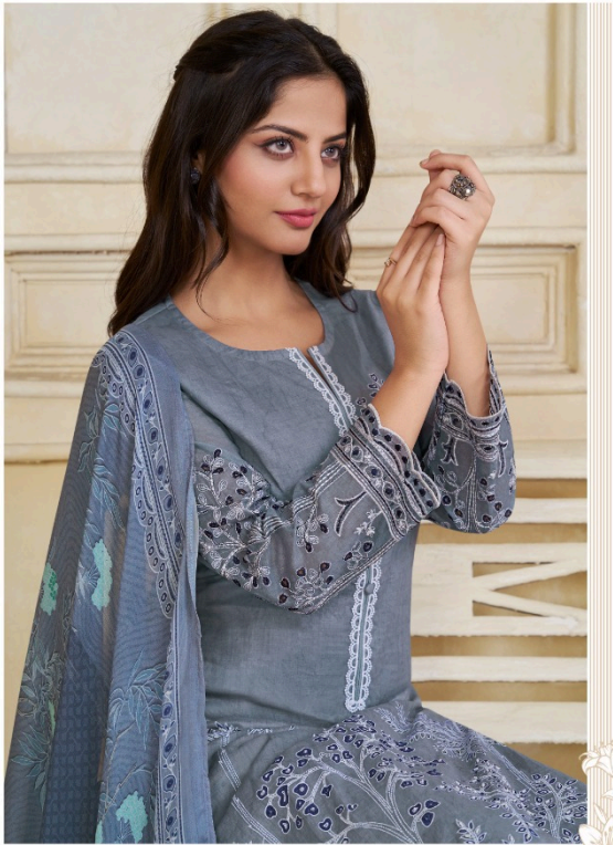
#1006 | FOR THOSE WHO EMBODY QUIET POWER.