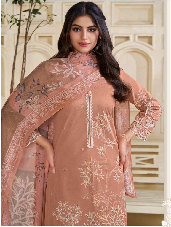
#1004 | UNVEIL YOUR INNER SOPHISTICATION.