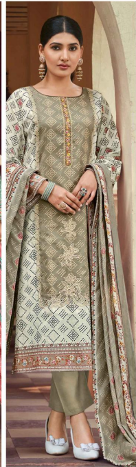
• 1004 •