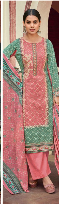
• 1003 •