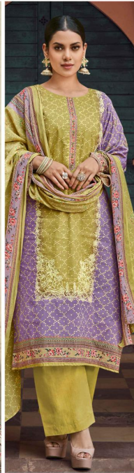
• 1005 •