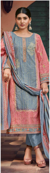
• 1001 •