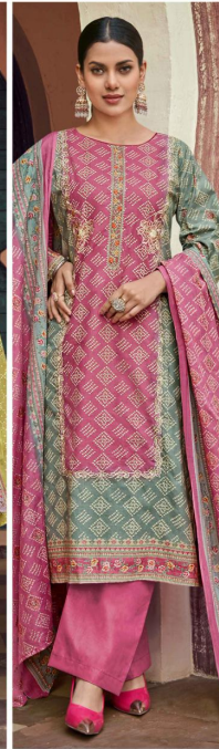
• 1006 •