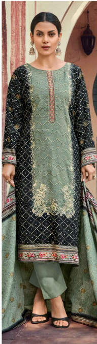
• 1002 •