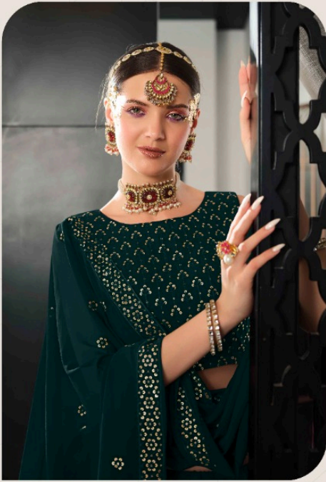
Popping up bright hues on emerald palette, with a shimmering of delicate floral motifs - it's just the on traditional charm. #2156