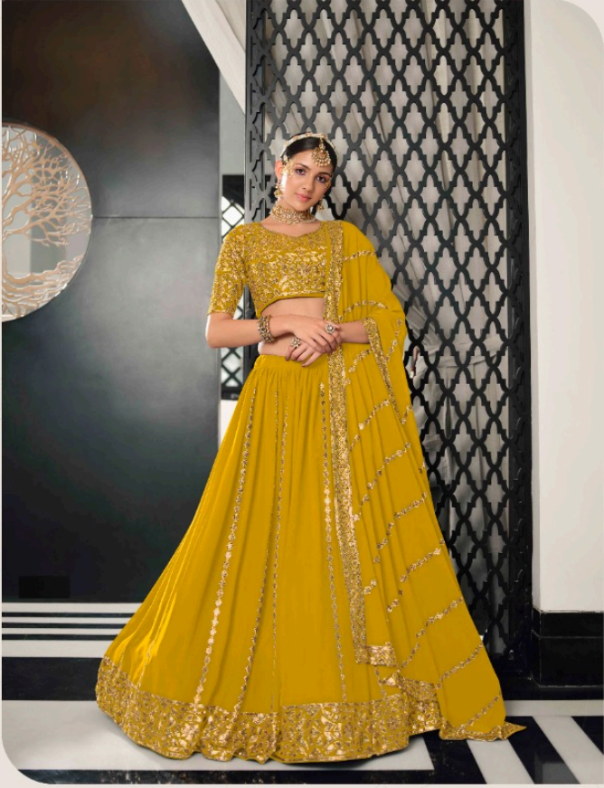
Popping up bright hues on an ivory palette with a scattering of delicate floral motifs – it's just the old traditional charm. #2153