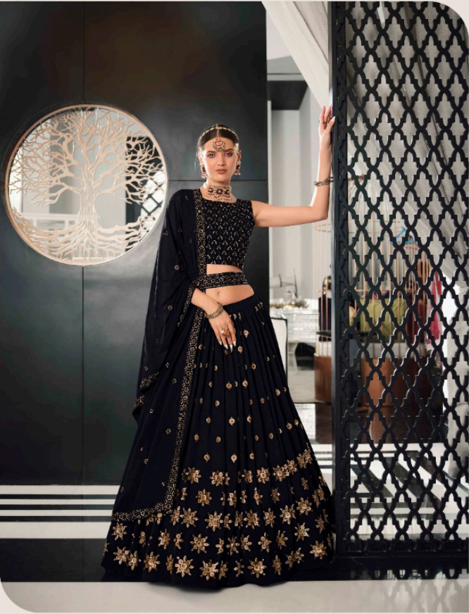
Popping up bright hues on an every palette with a smattering of delicate floral motifs - it's just the way traditional is done.