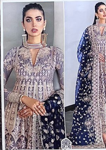
CHANTELLE VOL. 4 18005 HITE COLORZ TOP Butterfly Net With Embroidery ZAHA D.No. 1 BOTTOM-INNER saratoon D.No. 1