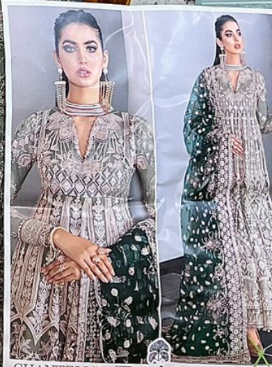
CHANTELLE ZAHA D.No/1002 10025 HITS COLORS Butterfly Net With Embroidery BOTTOM-INNER Skirt