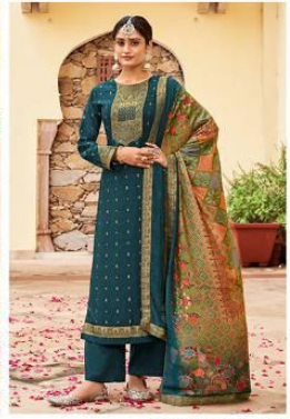
MANDAKINI | 6004