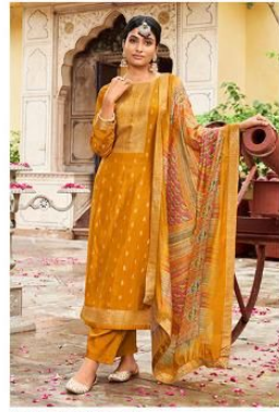
MANDAKINI | 6003