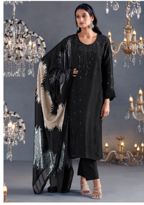
— 2162 —