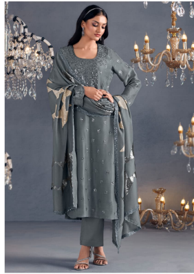
— 2166 —