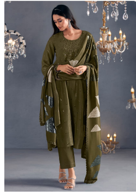
— 2163 —