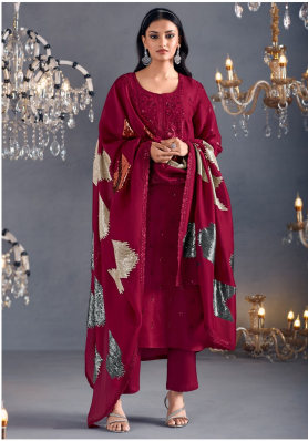
— 2165 —