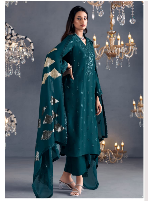
— 2164 —