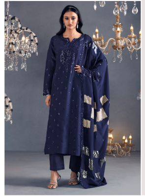
— 2168 —