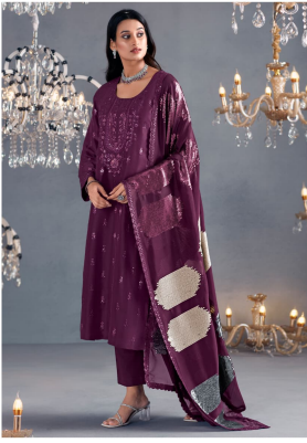
— 2161 —