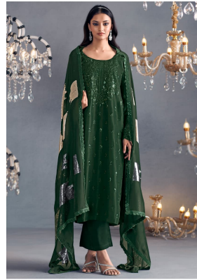
— 2167 —