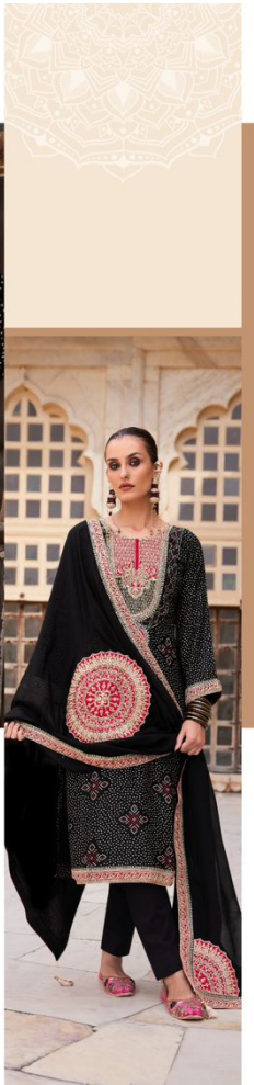
The TREND SETTER 15686