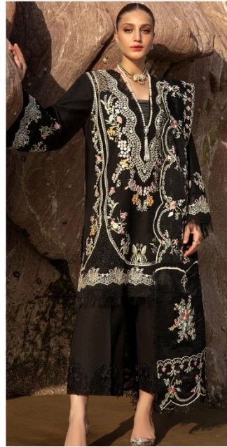
D NO 1003