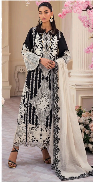
D NO 1002