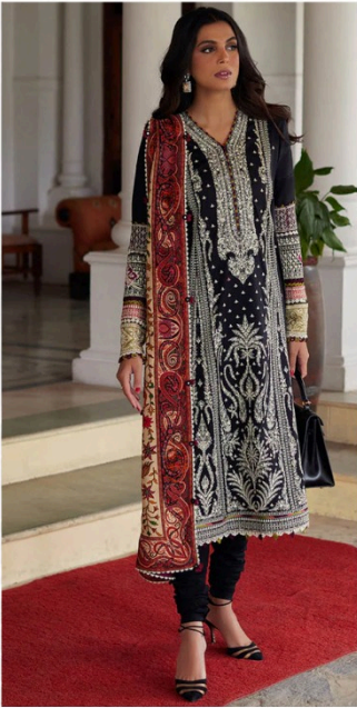
D NO 1001