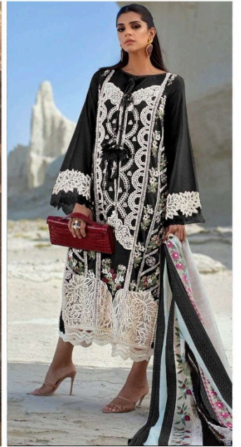
D NO 1004