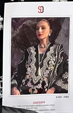
SD CONTENTS D NO - 1003 PURE COTTON EMBROIDERED BOWING WORK SILK COTTON EMBROIDERY WORK