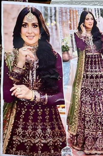
CHANTELLE Vol-6 Z D.No TOP BOTTOM- DUPATTA