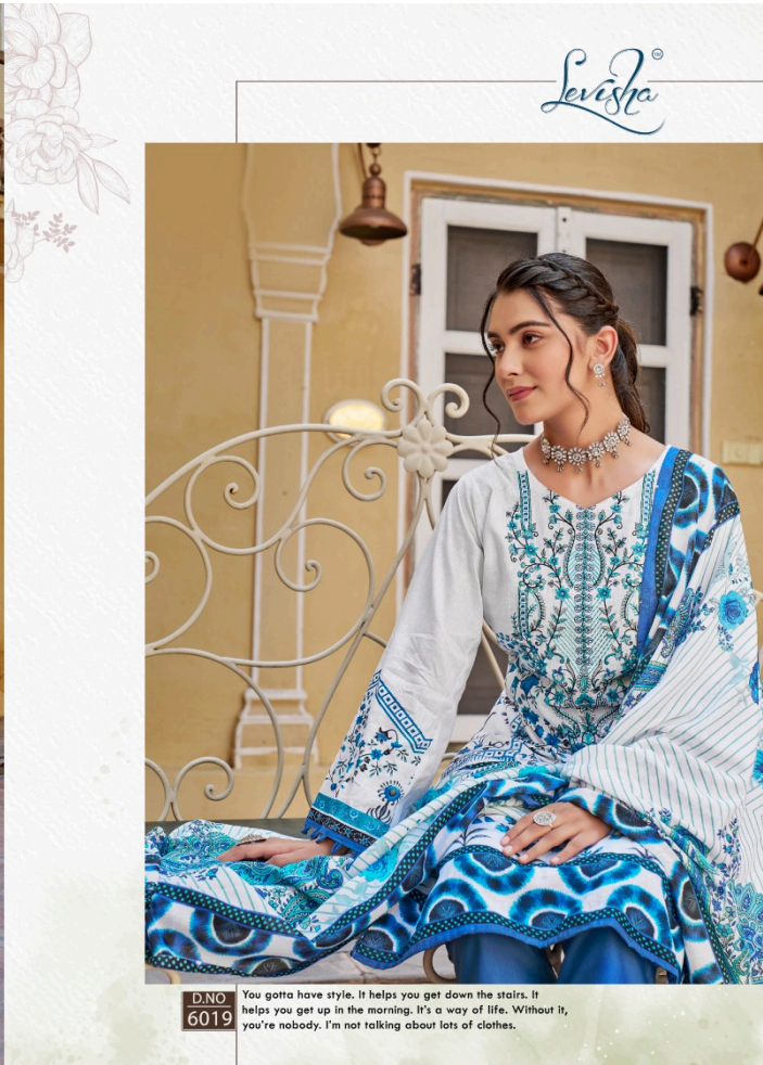
D.NO 6019 You gotta have style. It helps you get down the stairs. It helps you get up in the morning. It's a way of life. Without it, you're nobody. I'm not talking about lots of clothes.