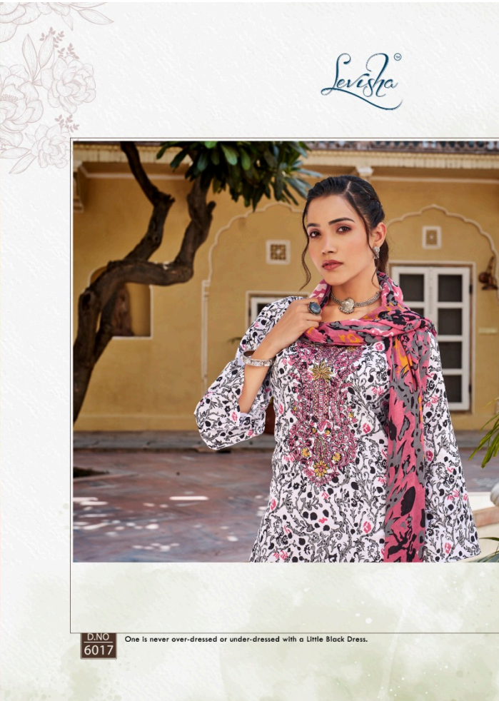
D.NO 6017 One is never over-dressed or under-dressed with a Little Black Dress.