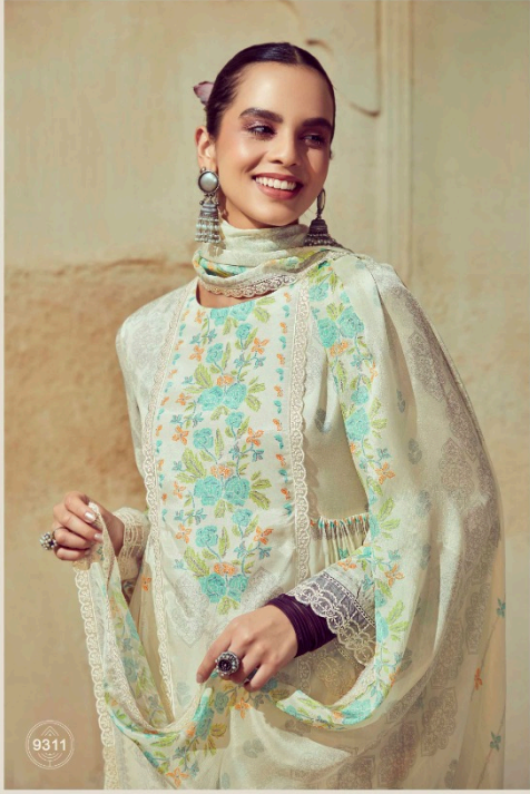
Vintage glamour reimagined.