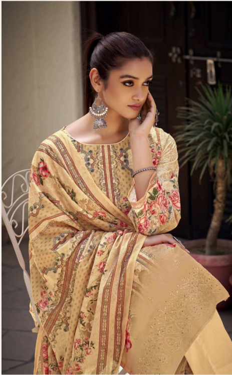
FASHION SPIRIT YOU WILL FIND OUR BRAND'S FABRICS ARE IDEALLY WITH AFFORDABLE STYLE TO YOUR WARDROBE! A MASTERFULLY PRINTED FABRIC 218001