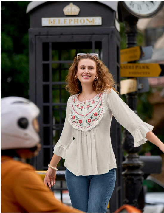
You can't scroll without complimenting my new Kurti swag