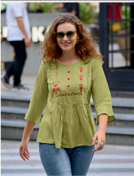
You don't have to be a model to gain attention. Wearing a dazzling Kurti is enough