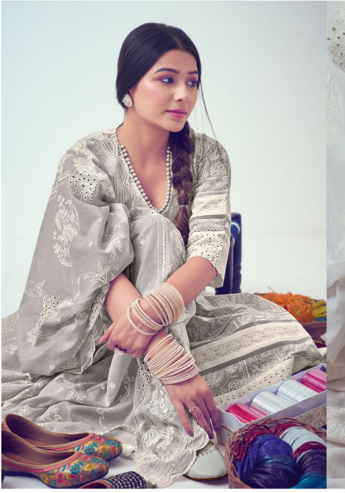
THE NEW AGE STYLE CALLS FOR A CHANGE IN TREND. DITCH HEAVY EMBROIDERY FOR SPECTACULAR PRINTS ON THE LIGHTER-THAN-AIR DRESS