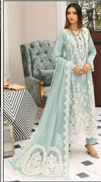
P - 8005 C