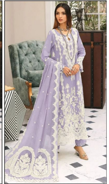
P - 8005 D