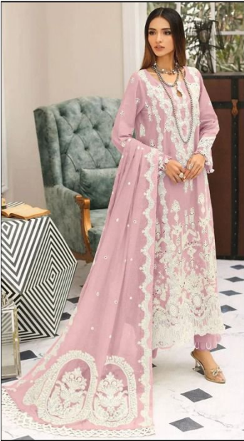
P - 8005 A