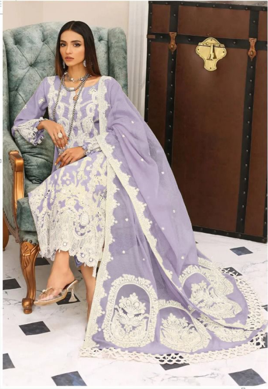
P - 8005-A