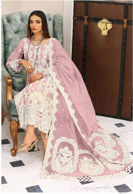
P - 8005-D