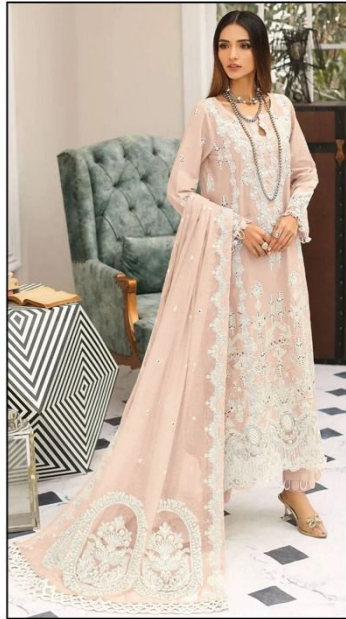
P - 8005 B