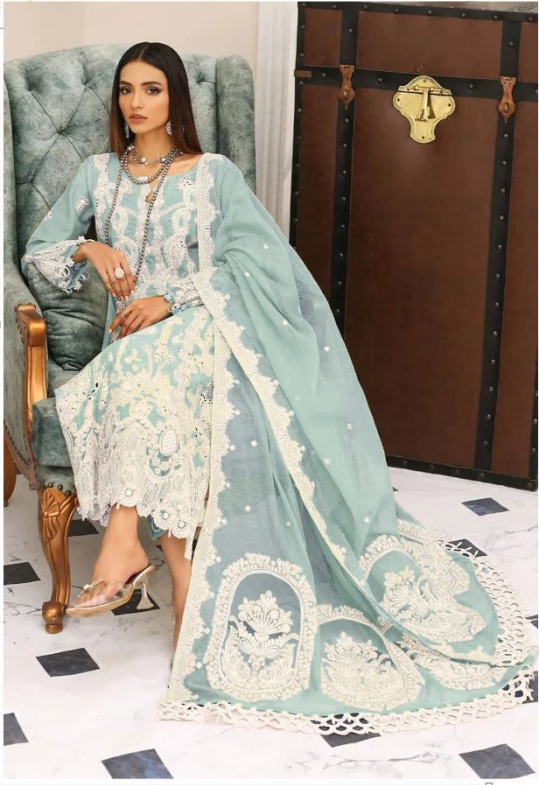
P - 8005-B