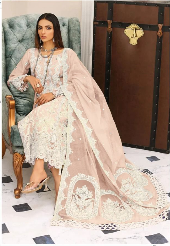
P - 8005-C