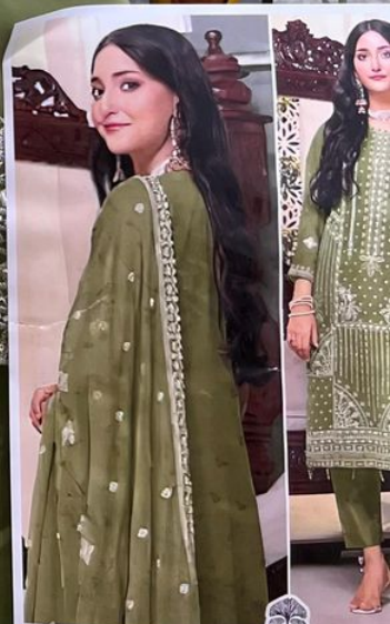
ZAHA TOP Faux Georgette with Embroidery (40-5 Mtr) BOTTOM-IN-IER D (C)