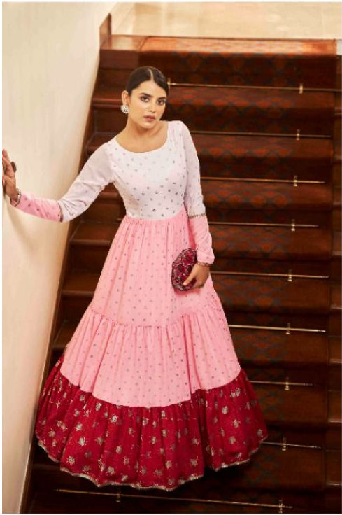
THIS SEASON LOOK UP WITH SOME TRULY INSPIRING & ELEGANTLY 4704