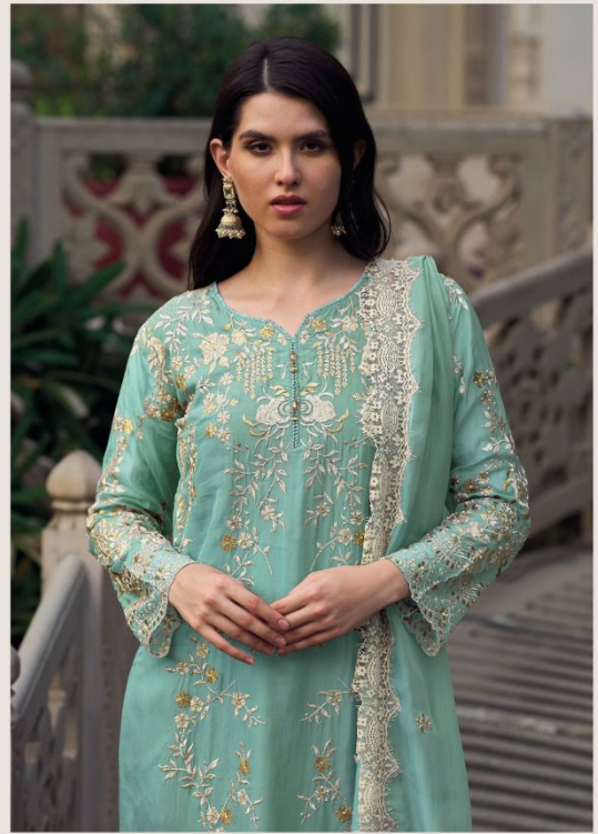
S design 1003 S