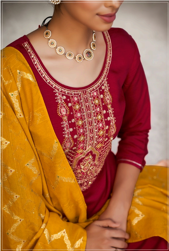
Fabrics made it cool and noticeable....