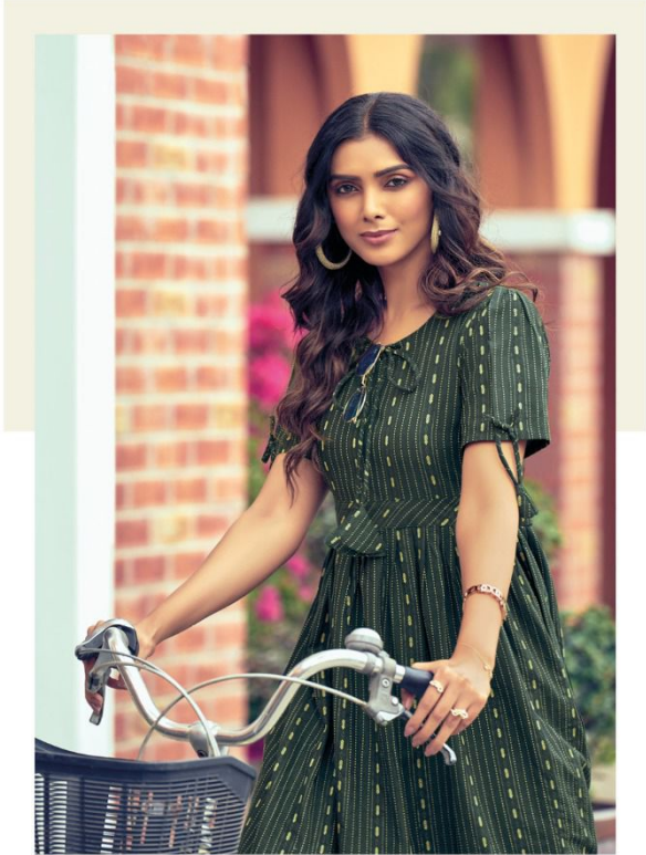
When a person is in fashion, all they do is right.