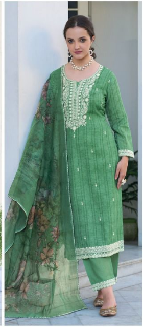
→ 1182 ←