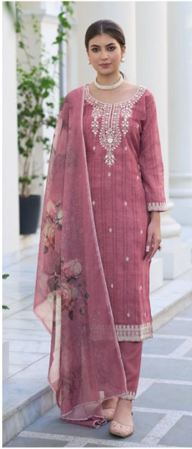
→ 1179 ←