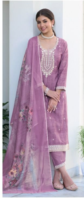
→ 1181 ←