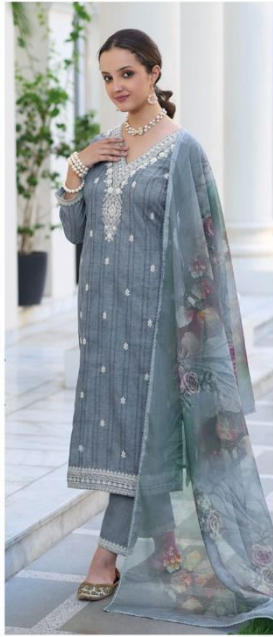
→ 1180 ←