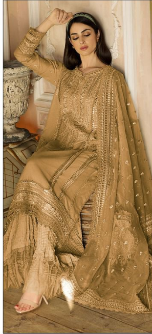
S - 137 G