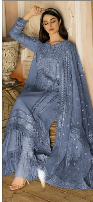
S - 137 F