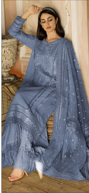
S - 137 F