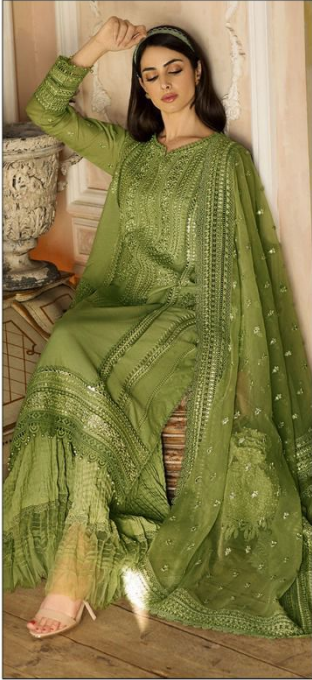
S - 137 E