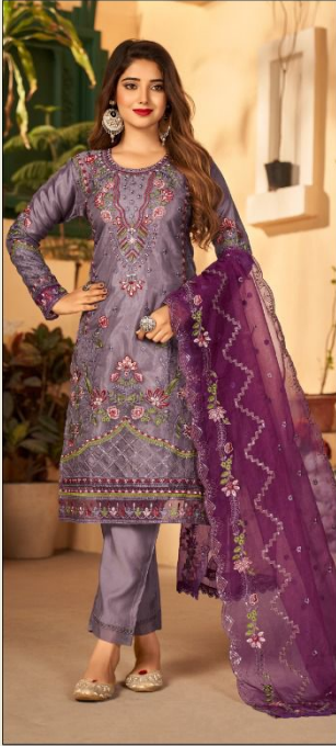
S - 164 A

CARE INTRUCTION • DRY CLEAN RECOMMENDED • DO NOT USE ANYTYPE OF BLEACH OR STAIN REMOVING CHEMICALS • DO NOT OVEREXPOSE DAMP FABRIC TO STRONG SUNLIGHT • IRON AT MODERATE TEMPERATURE