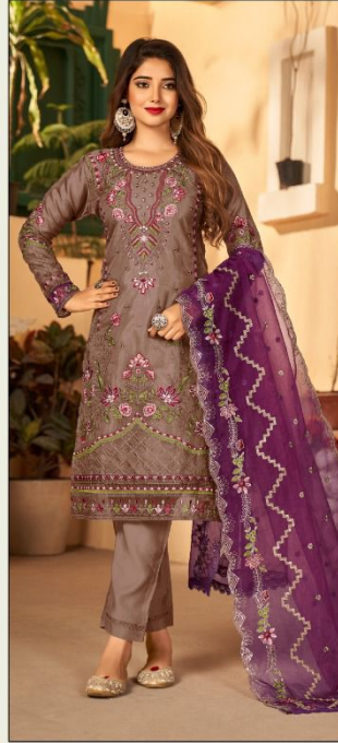
S - 164 C