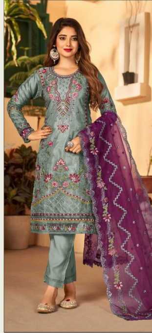
S - 164 B