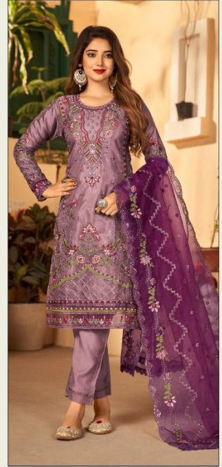
S - 164 D